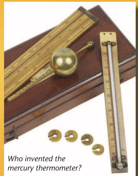
Who invented the mercury thermometer?